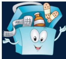
Earthquake and Safety Supplies