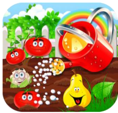
School Garden and Native Plant Garden