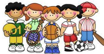
Physical Education and Equipment