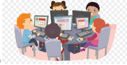
The Computer Lab