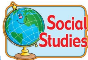
Enriched Social Science Instruction