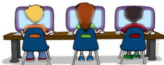
Compliance and Testing Staff